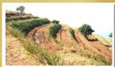
Soil and water conservation