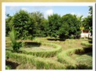
Keep soil moisture in orchard