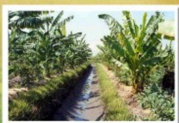
Increase organic matter