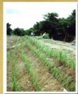
Reduce the speed of water run off