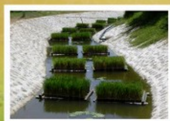
Absorb water - borne soil and toxic substances